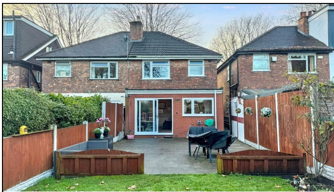
Holly Lane, Erdington, B24 9LH